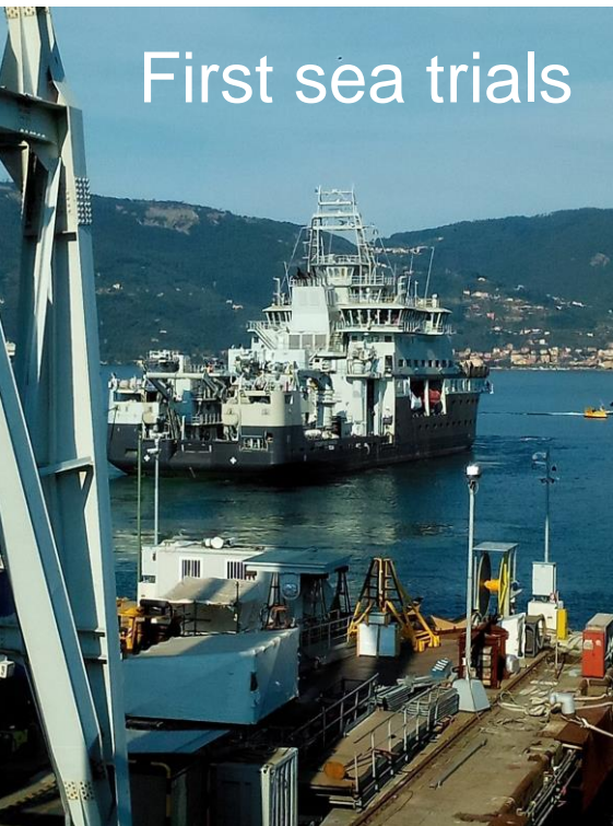
First sea trials