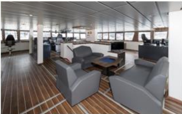
"Johan Hjort", New hybrid propulsion system and renovated bridge