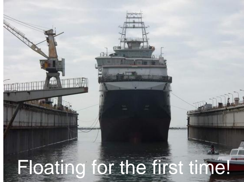
Floating for the first time!