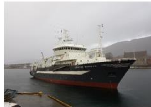
Transformation from tropical "Dr. Fridtjof Nansen" to arctic "Kristine Bonnevie"