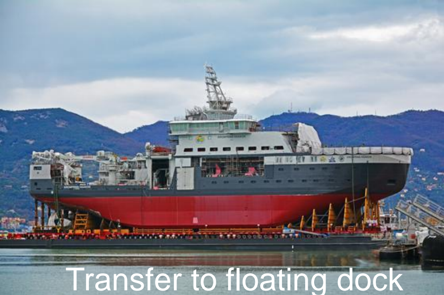
Transfer to floating dock